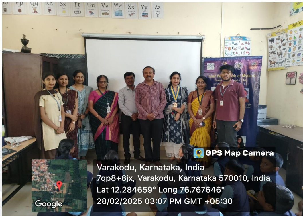
Pic: During Inauguration of the Awareness Program

Affiliated to VTU, Belagavi, Approved by AICTE, New Delhi and Recognized by Government of Karnataka, Programs accredited by NBA, New Delhi – UG: CV, ECE, EEE and ME (Validity up to June 2025), UG: CSE (Validity up to June 2026)