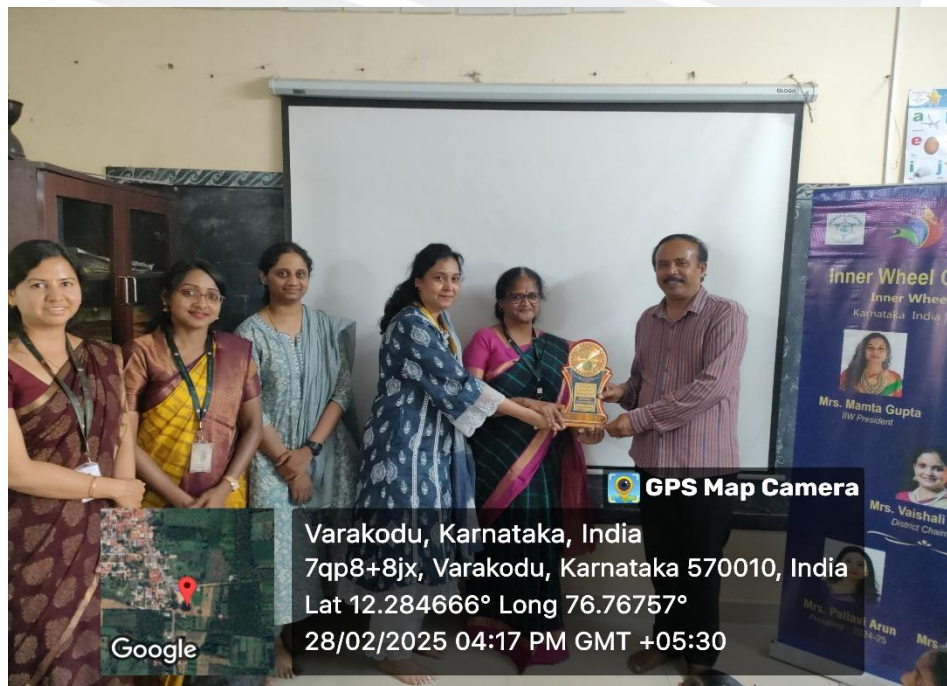
Pic: Awarding Memento to the Govt. Higher Primary School Head Master