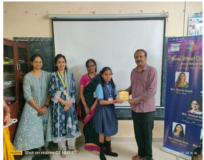
Pic: During Prize Distribution for Quiz Competition Winners