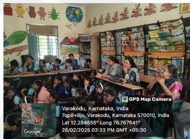
Pic: (a) During the Session Interaction