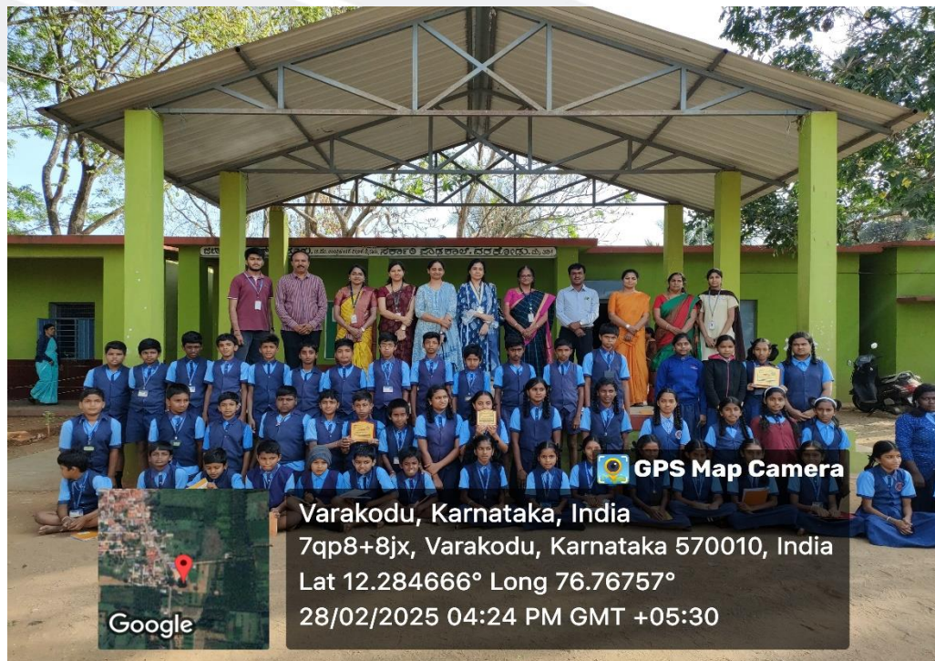
Pic: Group Photo with school students, headmasters and teachers