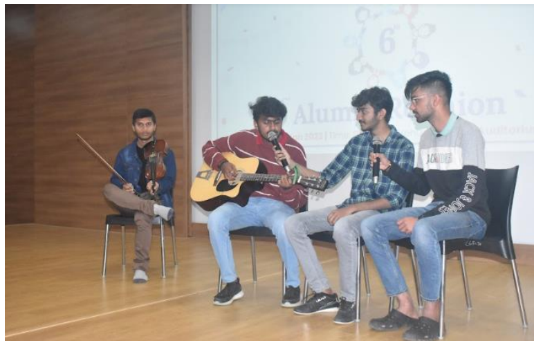
Figure: Cultural Performance by the students