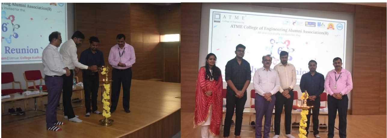
Figure: Lighting the lamp by the dignitaries