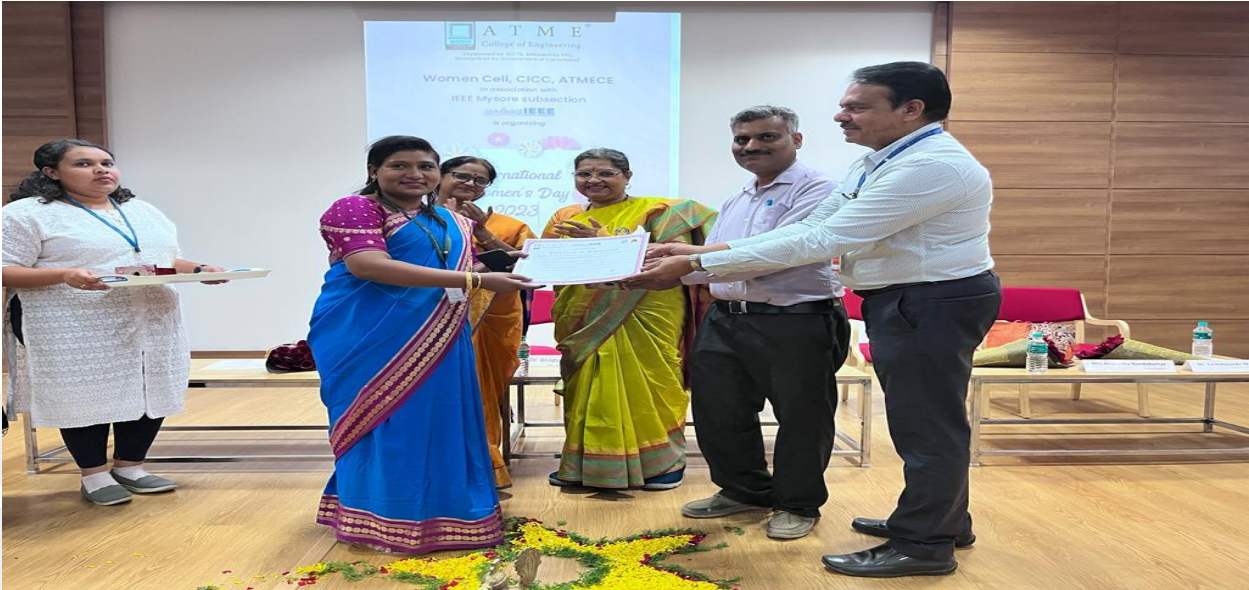
Distribution of certificates to faculty co-ordinators

Affiliated to VTU, Belagavi; Approved by AICTE, New Delhi and recognized by Government of Karnataka Programs accredited by NBA, New Delhi – CV, EC, EE and ME (Validity: 2022-23 to 2024-25)