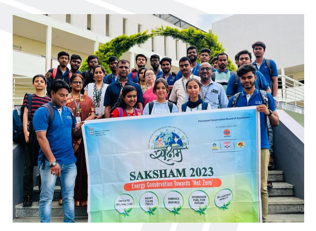
A glimpse of SAKSHAM 2023