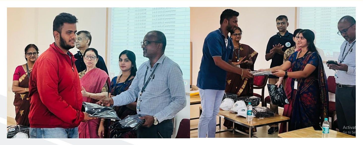
The winners are offered with the hoddies from Indian Oil Corporation

Affiliated to VTU, Belagavi; Approved by AICTE, New Delhi and recognized by Government of Karnataka Programs accredited by NBA, New Delhi – CV, EC, EE and ME (Validity: 2022-23 to 2024-25)