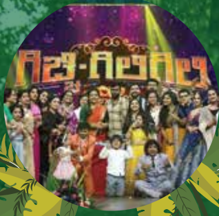
COMEDY SHOW FROM GICCHI GILI GILI