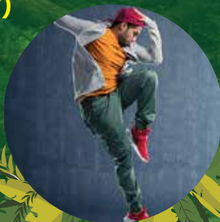
DANCE – SOLO, GROUP, DUET (WESTERN, TRADITIONAL)