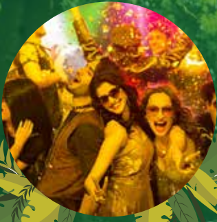
INTER COLLEGE CULTURAL FESTIVAL