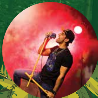
SINGING – SOLO, GROUP(FILMY) DUET(FILMY)