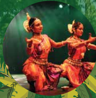
CULTURAL PROGRAM BY STUDENTS AND FACULTIES