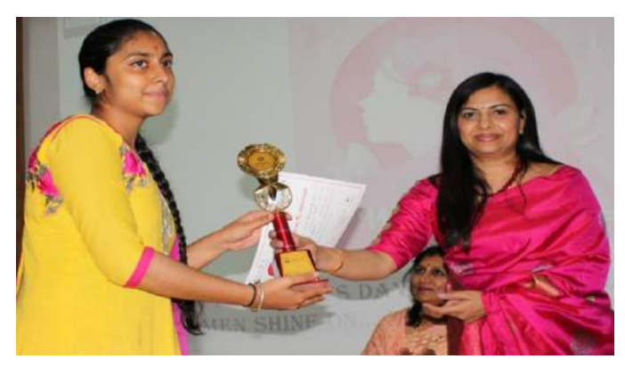
Distribution of prizes to Students