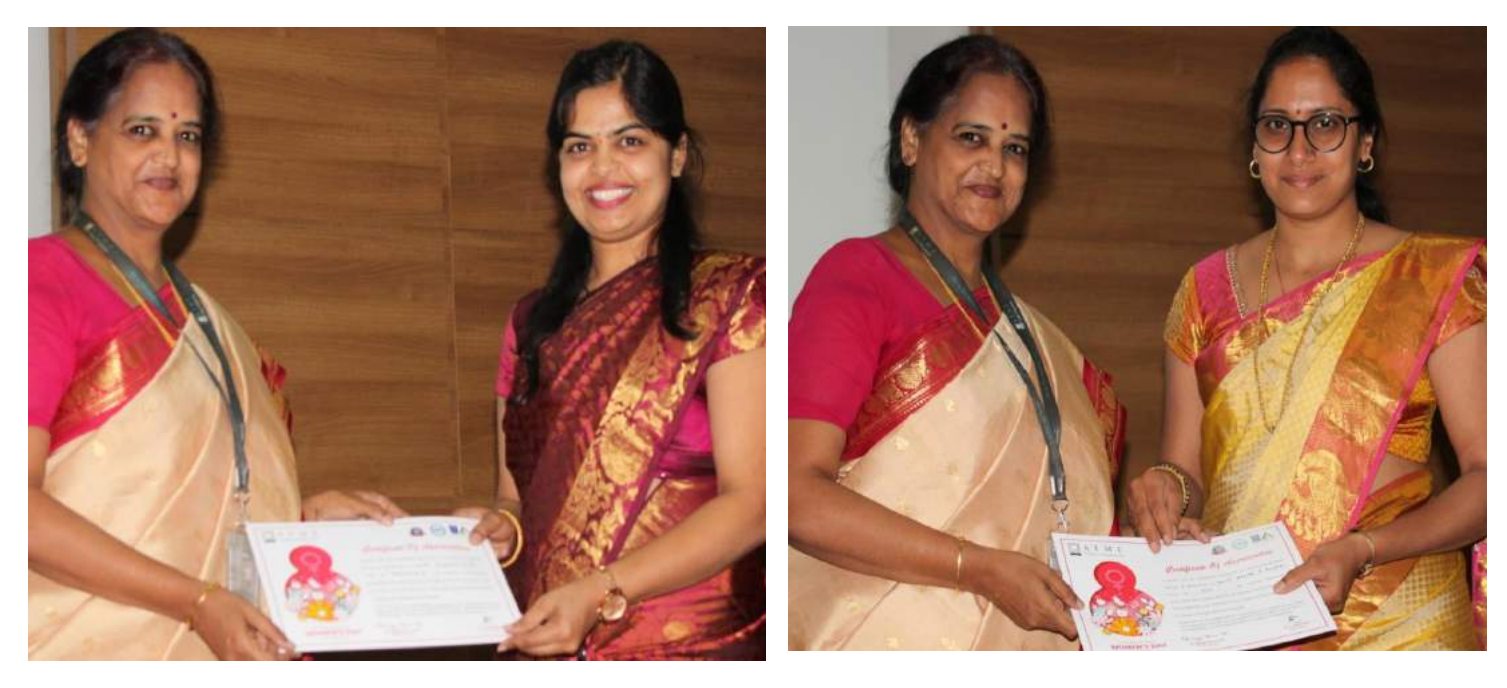
Distribution of certificates to faculty co-ordinators