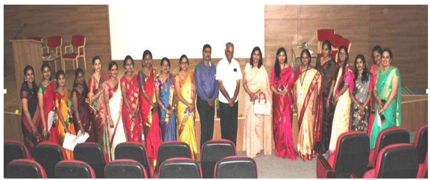
The programme got conclude with Vote of Thanks