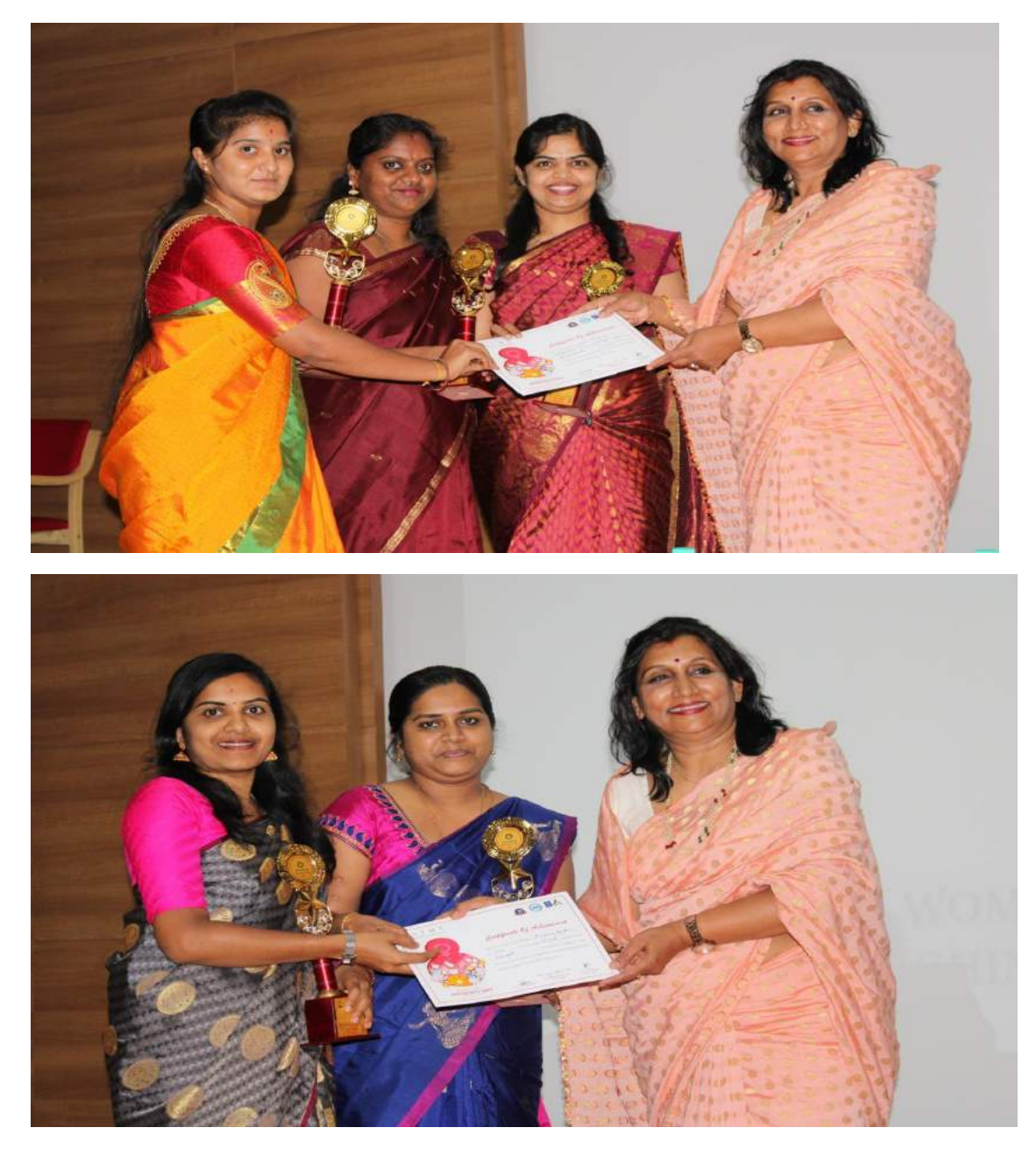
Distribution of prizes to Faculty